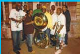
Rebirth Brass Band

Bobby McFerrin presents VOCABULARIES w/ Howard University's Afro Blue Reunion Choir Warner Theatre • 7:30 PM